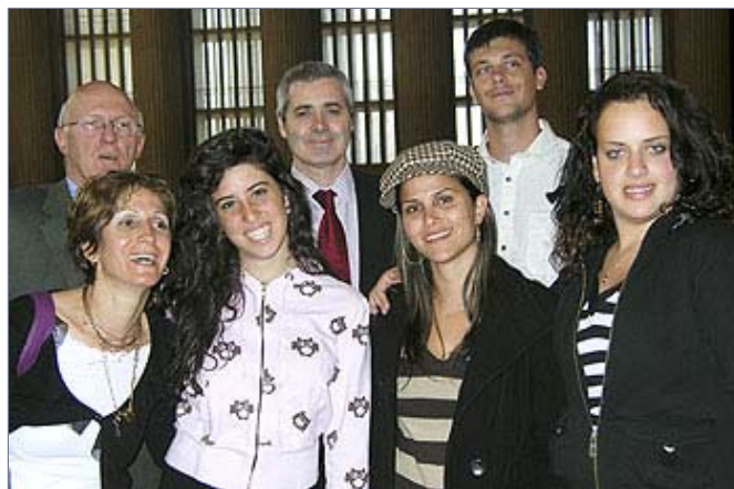
The Sederot delegation was greeted upon arrival at 30th Street Station by Israeli Consul Leo Vinovezky (second from left, back row) of the Consulate General of Israel in Philadelphia.

Most of their April 13-17 visit was spent in New York, where the ambassadors talked to high-school students and media representatives about their harrowing daily life, but they